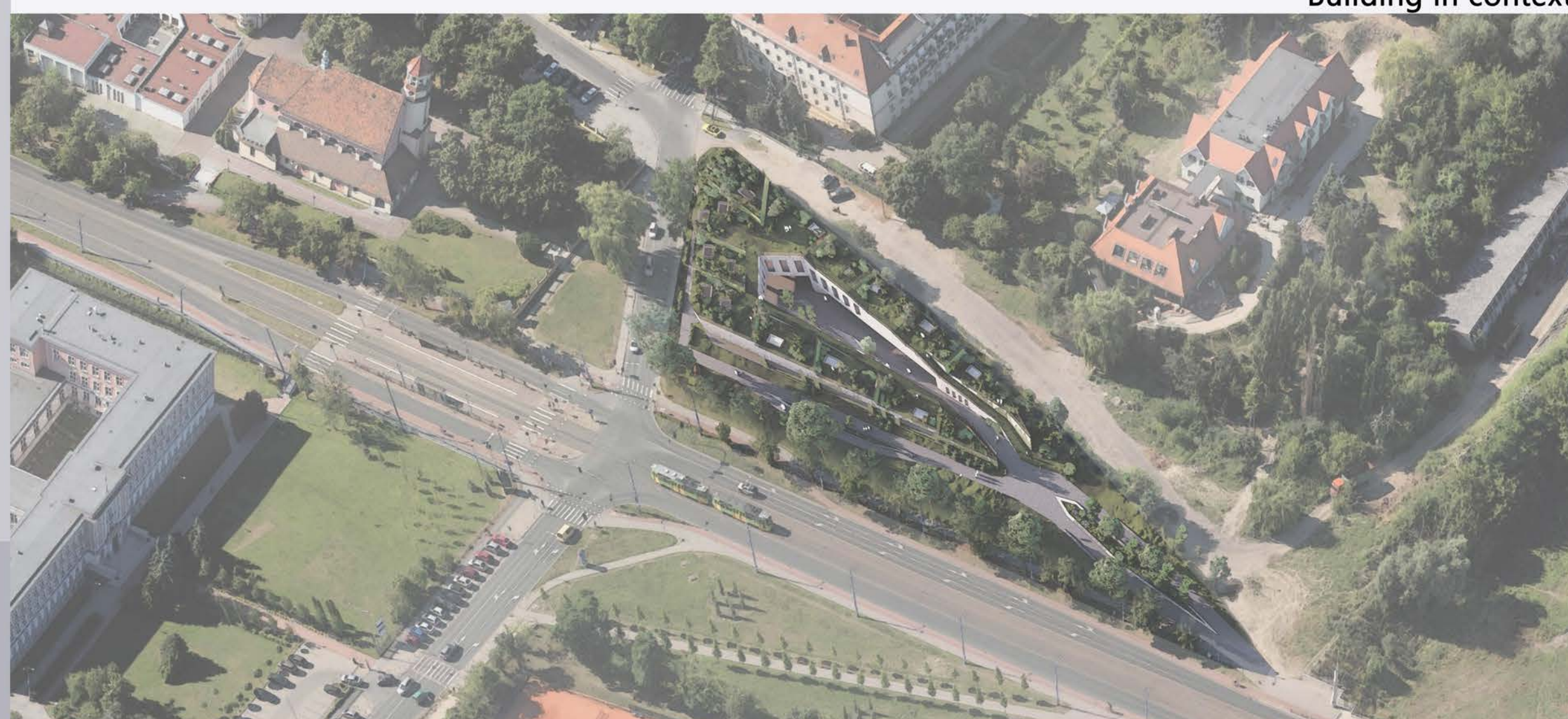
Building in context